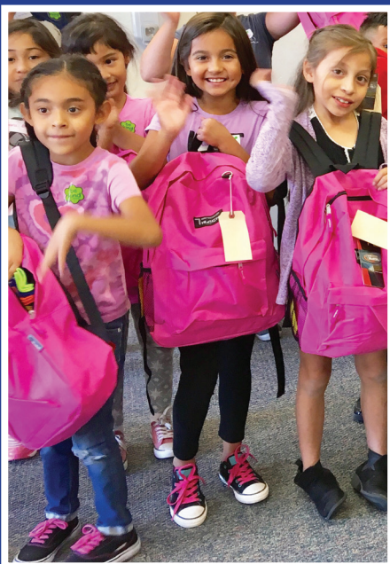
New backpacks make for smiles all around.

100% of donations stay in the greater Tucson area to benefit our community