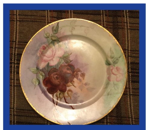
Great grandma's plate

We made new friends and answered the questions: Trash or Treasure? Junk or Jewelry? A personal view of the event.